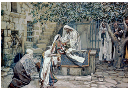
Fig. 4, James Tissot, Public domain, via Wikimedia Commons