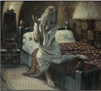
Fig 3. James Tissot

God loves when people call out to Him for mercy. Human pride does not want to ask God for mercy. We want to earn everything we get, but when a person humbles themselves and realize they could never earn the mercy they need, they find the true help